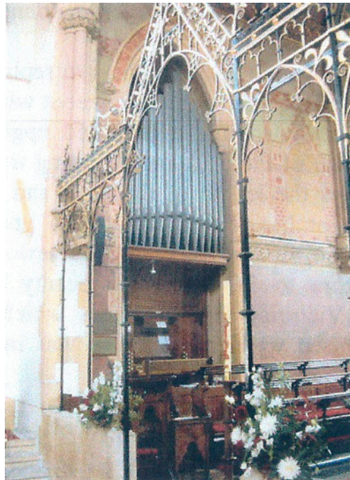
Henry "Father" Willis Organ 1887