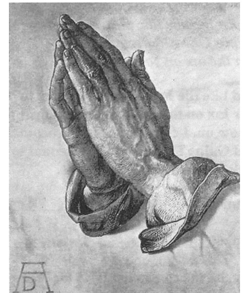
Drawn by Albrecht Durer, circa 1505

For those kind enough making a Standing order donation Please quote reference "Friends" + your name